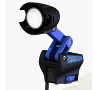
Shoe & Stud Mount